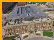
SINGLE PLY ROOFING