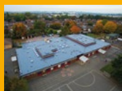
LIQUID APPLIED ROOFING